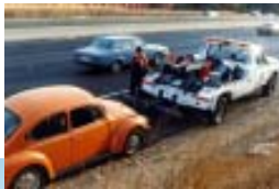
FSP trucks are white and display the FSP logo

In addition to reducing congestion, the Freeway Service Patrol program helps make our freeways safer by providing valuable motorist assistance. Another benefit is improved air quality.