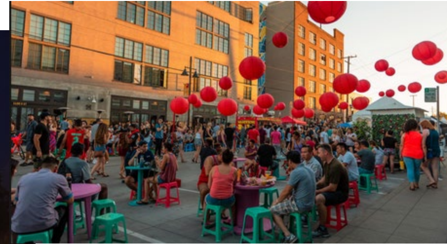
Sacramento – R Street