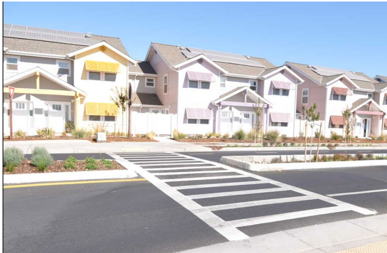
Sacramento County – Freedom Park Drive