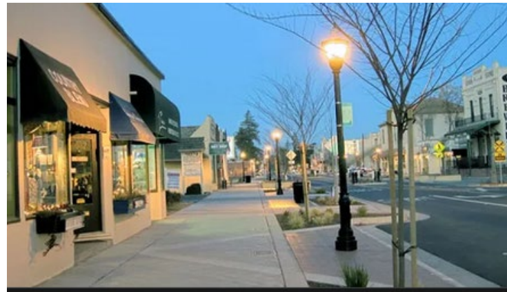
Elk Grove - Old Town