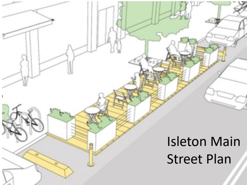
Isleton Main Street Plan