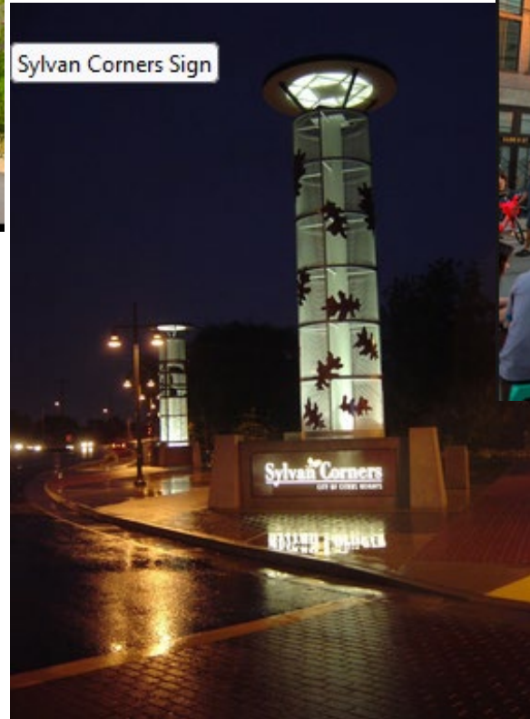
Citrus Heights – Auburn Blvd