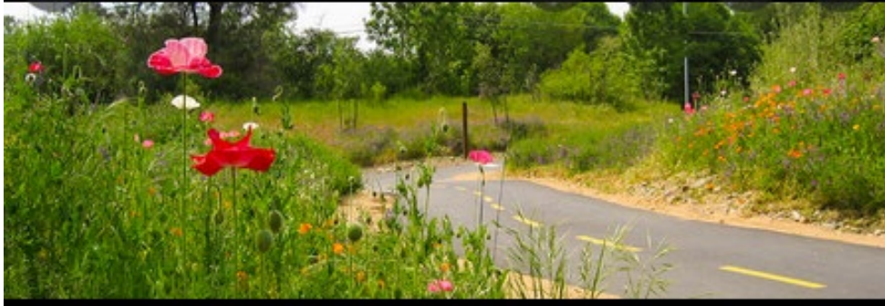
Folsom – bike trail